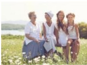
The Art of Family Storytelling Workshop

Topics below will be customized to meet the needs of a particular audience: